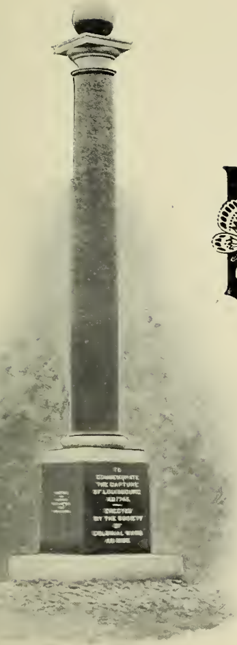
THE LOUISBURG MONUMENT.

Cape Breton is a land of delightful scenery. The Bras D'Or Lakes are a lovely body of placid water, reflecting the graceful outlines of the encircling hills. On the way to ancient, historic Louisburg the railway skirts Mira River and Catalone Lake, blissful and contented nature places. Louisburg is worth a visit, and a day could be delightfully spent, "Parkman" in hand, fighting over again the two great battles that were fought there for the mastery of half a continent. The erstwhile quiet little metropolis of the island, Sydney, is now witnessing a new birth, and a great northern Pittsburg is to arise here, dictating iron prices to the world. Its two thousand people, it is expected, will in ten years grow to 40,000, and Sydney will become an important commercial and manufacturing centre. The boom which has struck Sydney, will, it is expected, next strike North